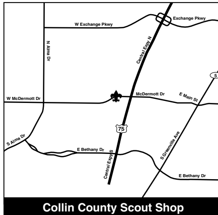
Collin County Scout Shop