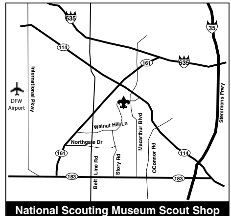
National Scouting Museum Scout Shop